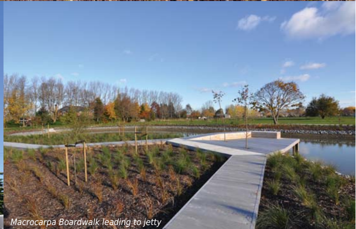
Macrocarpa Boardwalk leading to jetty