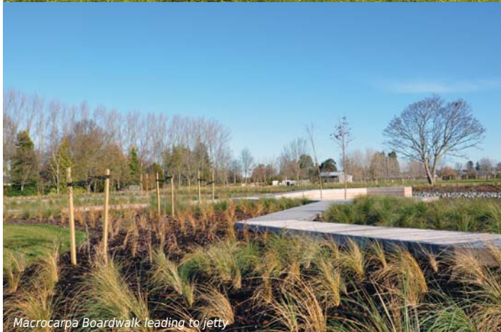
Macrocarpa Boardwalk leading to jetty