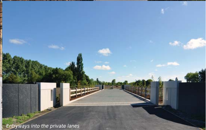
Entryways into the private lanes