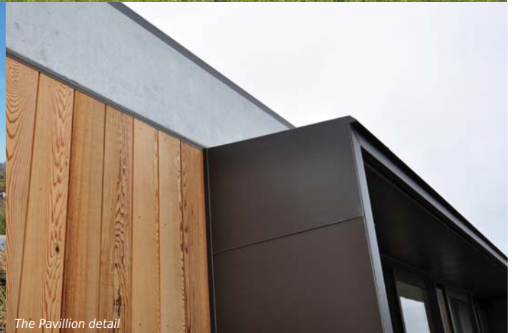
The Pavillion detail