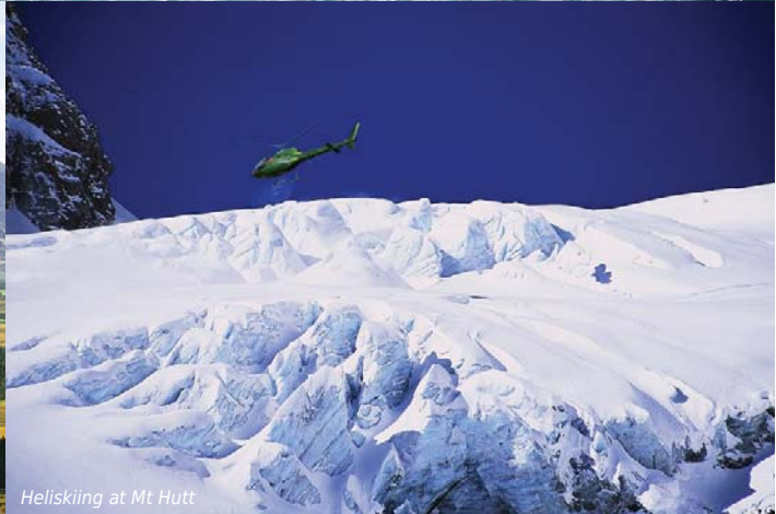
Heliskiing at Mt Hutt