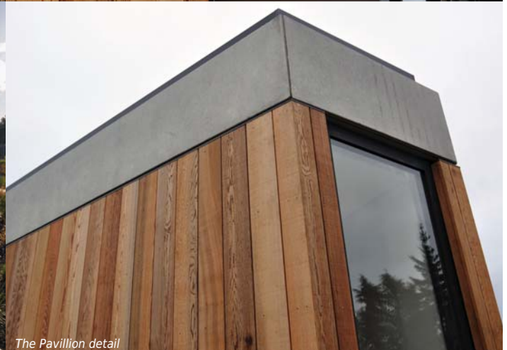
The Pavillion detail