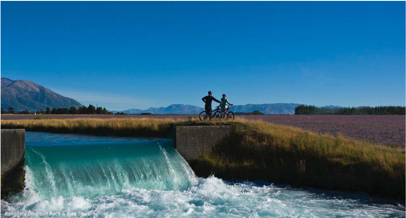
Rangitata Diversion Race & Bike Trails