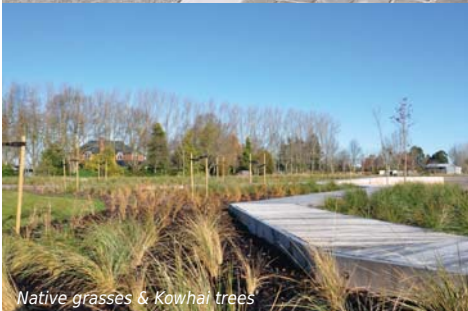
Native grasses & Kowhai trees