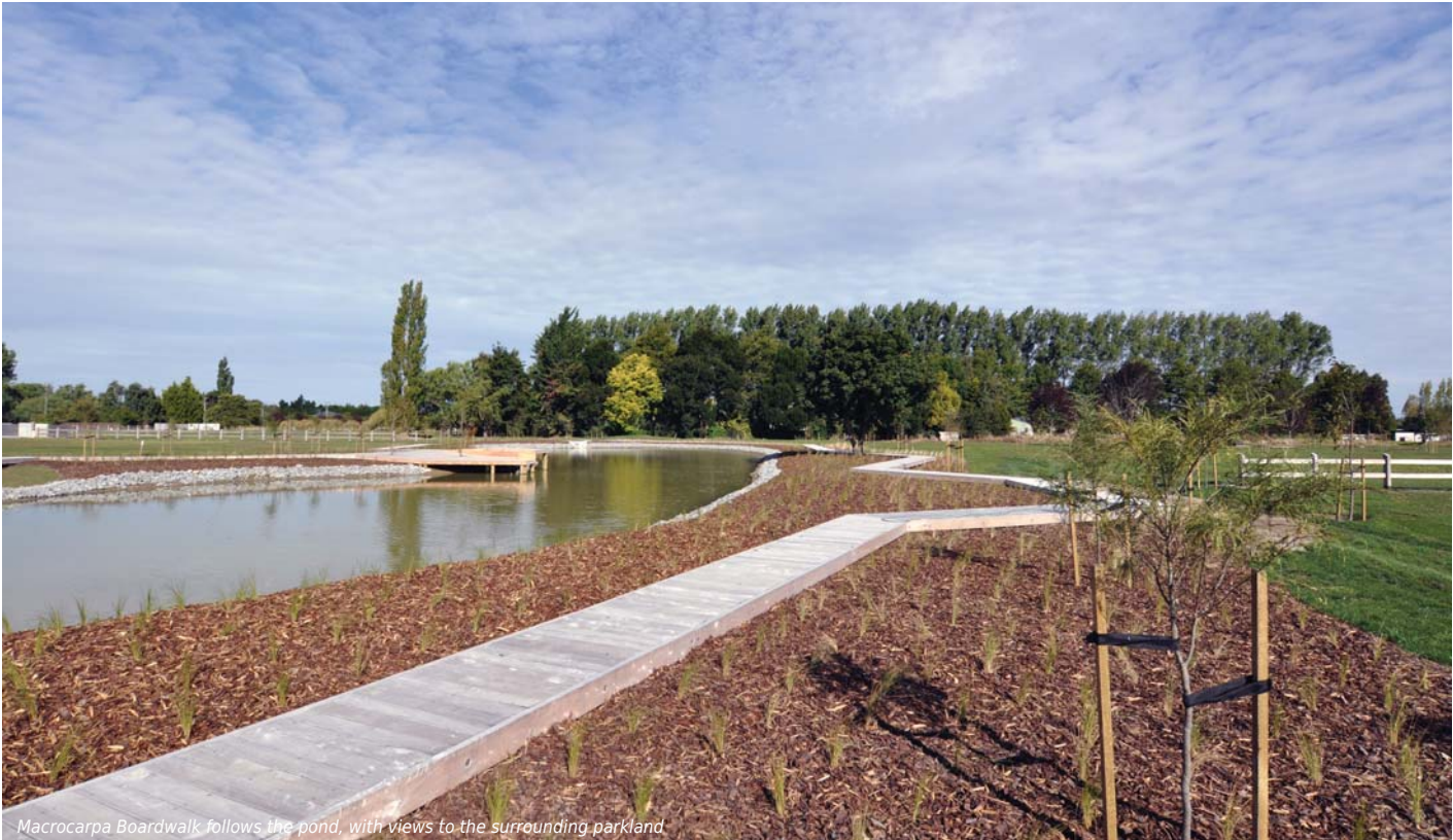
Macrocarpa Boardwalk follows the pond, with views to the surrounding parkland