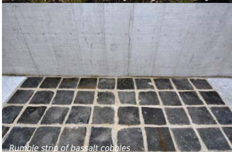
Rumble strip of basalt cobbles