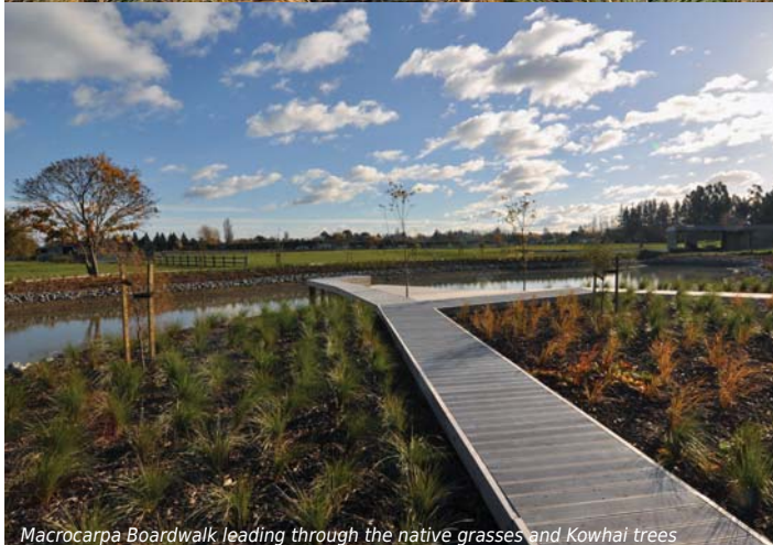
Macrocarpa Boardwalk leading through the native grasses and Kowhai trees