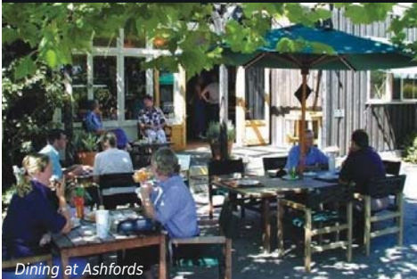
Dining at Ashfords