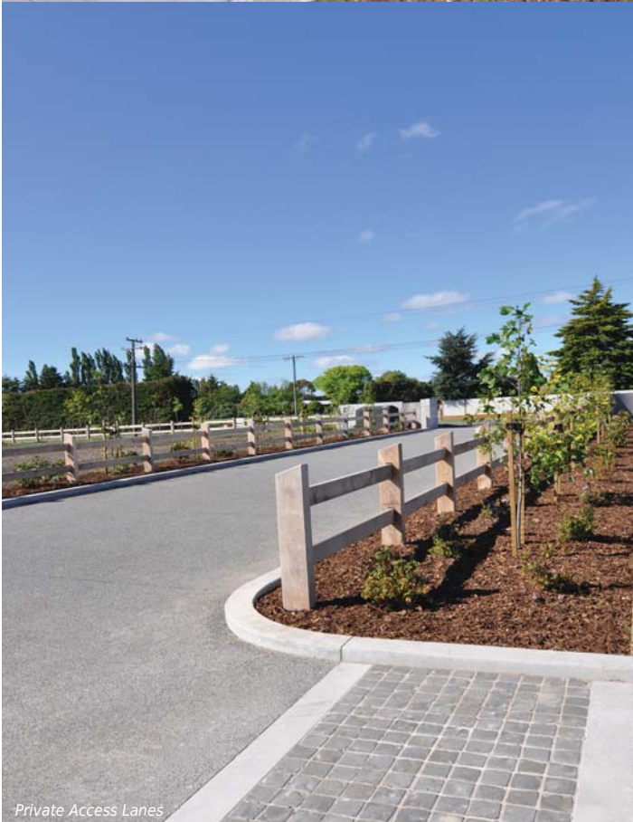
Private Access Lanes