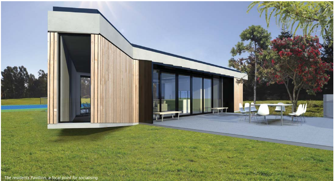
The residents Pavillion, a focal point for socialising