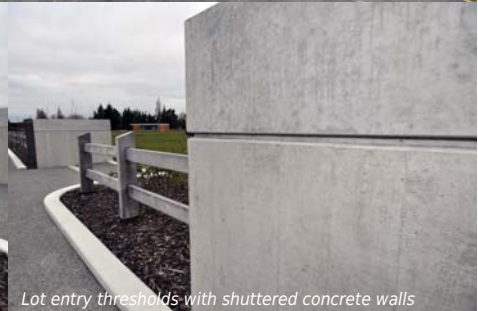
Lot entry thresholds with shuttered concrete walls