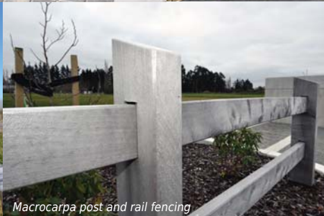
Macrocarpa post and rail fencing