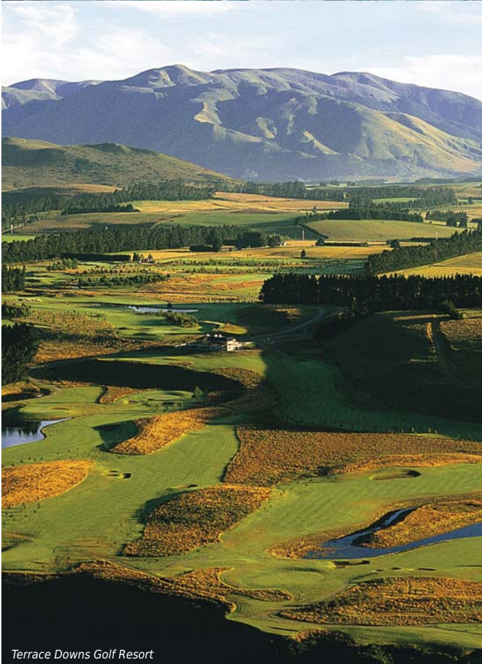
Terrace Downs Golf Resort