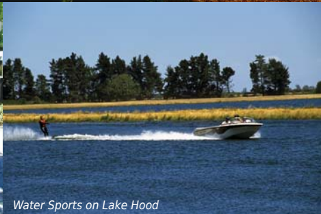
Water Sports on Lake Hood