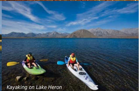
Kayaking on Lake Heron